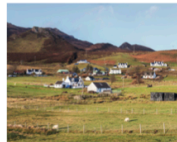
The countryside is used mostly for farming and conservation.